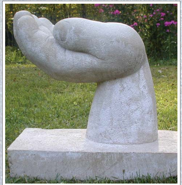
Featured at The Museum of Fine Arts, Boston "Art in Bloom" Garden Gallery, April 24-27, 2004