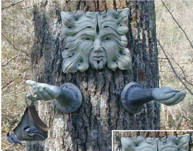
3-piece Leaf Man Set Includes: leaf man face, left hand and right hand. Sculpture looks life-like on a tree.